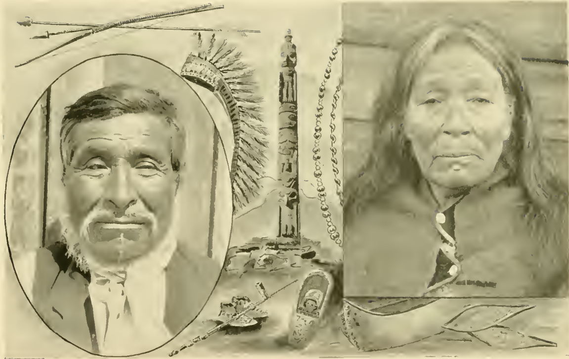
Typical Indian Faces.